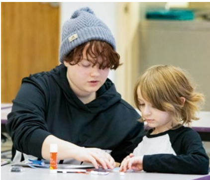
High school and elementary students get together for the Reading Buddies program.

Students from Hannibal High School will now be partnering with second and third grade students at Fairley Elementary for an exciting new "reading buddies" program each month.