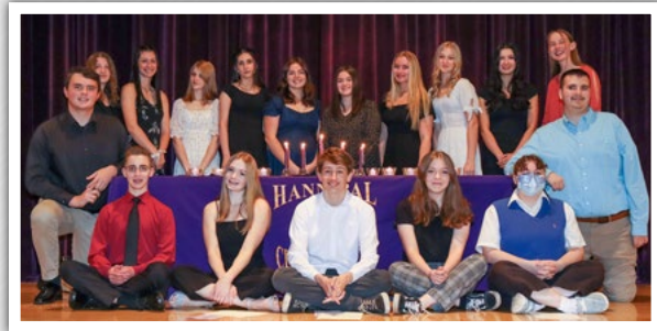
The 2022 Hannibal High School National Honor Society inductees gather for a photo following the recent ceremony welcoming them into the prestigious organization.