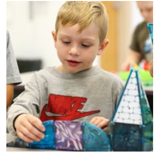
A Hannibal UPK student taps into his imagination and STEAM skills while building a structure with Magna Tiles. The district recently secured a $245,000 grant for its full-day UPK program.