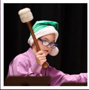
Decked out in a Santa hat, a Dennis M. Kenney Middle School student plays the drums during a recent concert.

Several dozen Hannibal Central School District student musicians recently took the Lockwood Auditorium stage to perform holiday concerts.