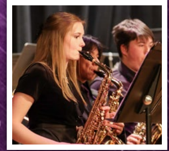
Hannibal High School band students perform a holiday concert in mid-December.

The HCSD Music Department hosts a variety of concerts throughout the school year. For a full list of upcoming events, visit hannibalcsd.org .