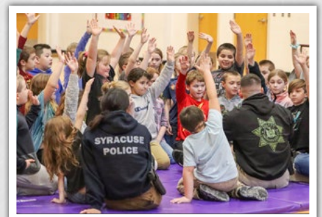
Fairley third-graders ask questions to area law enforcement personnel during a career exploration activity.