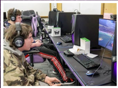
Members of the Hannibal Central School District's esports team practice on state-of-the-art equipment. The team's spring sports season is just around the corner.

After a successful inaugural season in the fall, the Hannibal Central School District's esports team is gearing up for its spring season.