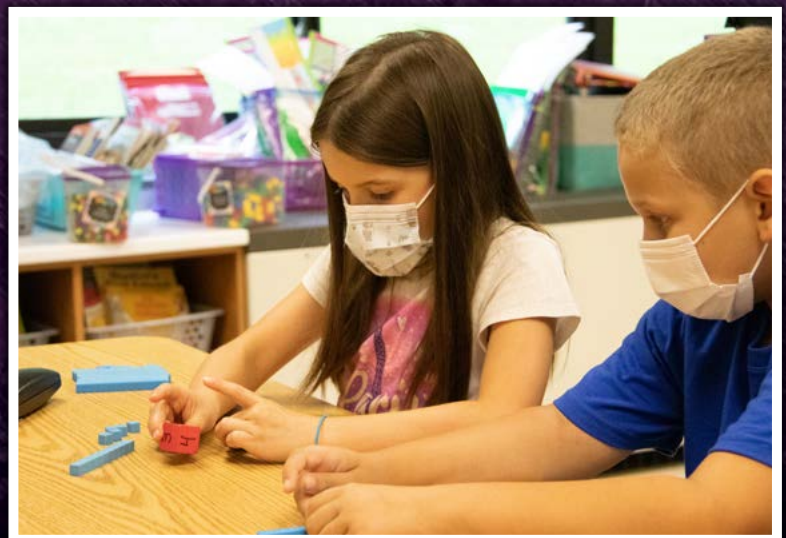
Fairley Elementary students hone their math skills while attending the Summer Institute during August.